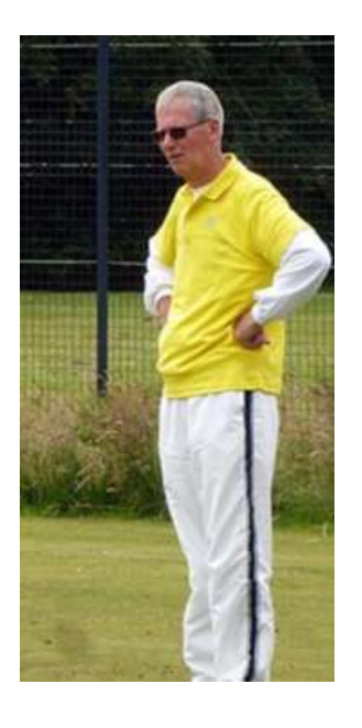
Now how did that happen?